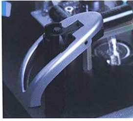
Avant architect in-wall SmartLoc™

SmartLoc is unique to Avant architect™. This patent-pending clamping system enables quick and easy mounting with minimal disruption to existing décor. The entire range can be accommodated in virtually all partition walls without the need for fitting