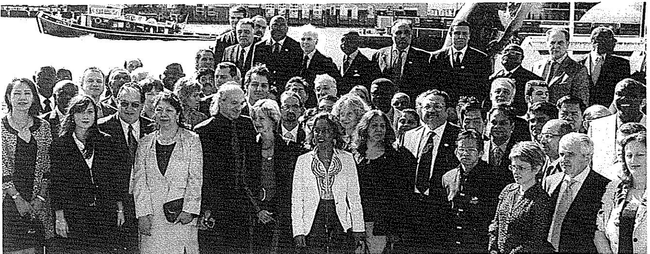
Following the International Quality Crown commencement speeches, the media representatives covering the event directed a photography session of the encounter between these eminent business leaders which represent multiple backgrounds, languages and cultures. The session took place on the banks of the River Thames, in front of the symbolic Tower Bridge of London.

formed by business leaders who embrace innovation, bringing forth growth and development for their communities.