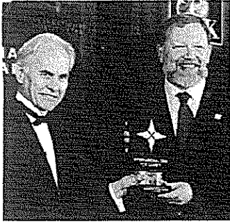
Mr. Sergey Dubinin, Deputy Chairman of RAO Unified Energy System of Russia (former Minister of Finance in Russia) and Chairman of the Central State Bank of Russia.