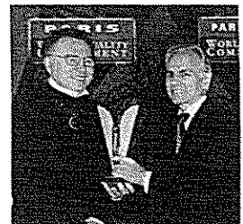
Mr. Slava Zaitsev, Russia's most prestigious haute-couture designer, who was designated honorary citizen of Paris by Former President Jacques Chirac, was awarded by BID in Paris.